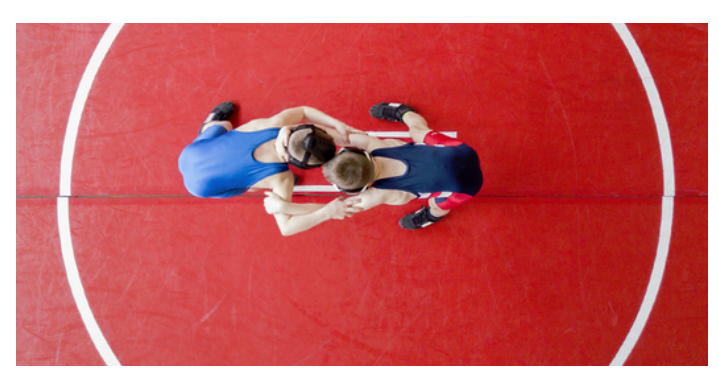
Wrestling Individuals Championships February 25–26 @ Anderson, SC ~ Click image above ~